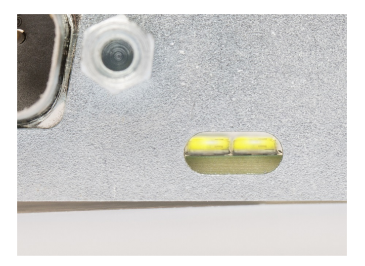
Figure 3: LEDs on the Kvaser PCIEcan 2xCAN v3.