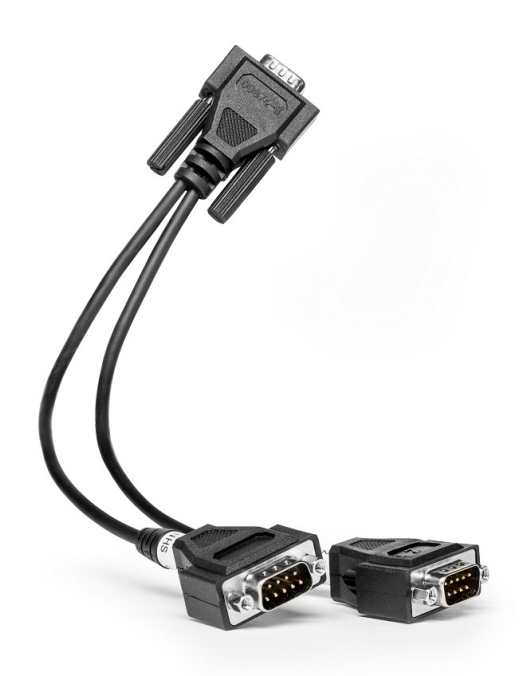
Figure 5: The DS9-2xDS9 Splitter

Table 3: Pin configuration of the DS9-2xDS9 splitter