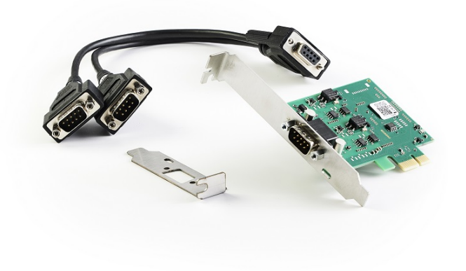
Figure 1: Kvaser PCIEcan 2xCAN v3

Kvaser PCIEcan 2xCAN v3 is a small, yet advanced, CAN multi-channel real time CAN interface that handles transmission and reception of standard and extended CAN messages on the bus with a high time stamp precision. The Kvaser PCIEcan 2xCAN v3 is compatible with applications that use Kvaser's CANlib.