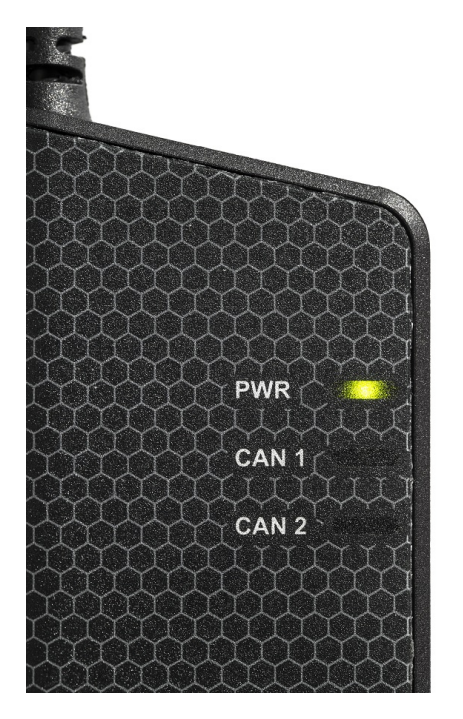
Figure 3: LEDs on the Kvaser USBcan Light.

The Kvaser USBcan Light has three LEDs as shown in Figure 3. Their functions are shown in Table 2.