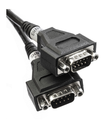
Figure 2: CAN connectors on Kvaser USBcan Light 2xHS

The Kvaser USBcan Light has two CAN Hi-Speed channels with 9-pin D-SUB CAN connectors (see Figure 2). See Section 4.2, CAN connectors, on Page 9 for pinout information.