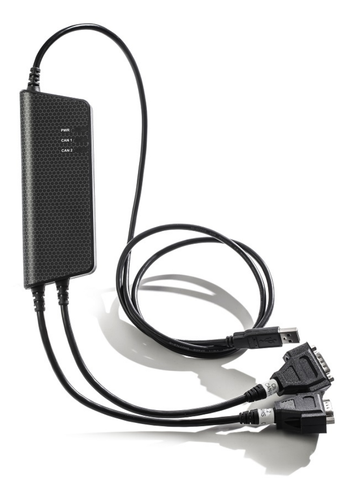
Figure 1: Kvaser USBcan Light

Kvaser USBcan Light is a reliable low cost product. With a time stamp precision of 100 microseconds it handles transmission and reception of standard and extended CAN messages on the bus. It is compatible with applications that use Kvaser's CANlib.