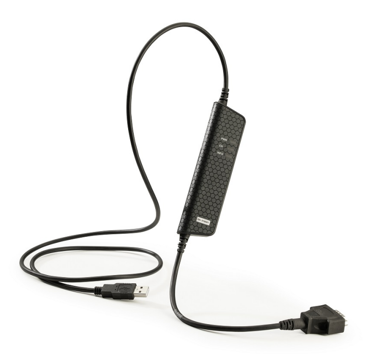
Figure 1: Kvaser Hybrid CAN/LIN

Kvaser Hybrid CAN/LIN is a single channel interface where the channel can be opened either as CAN or LIN. The Kvaser Hybrid CAN/LIN is compatible with applications that use Kvaser's CANlib and LINlib.