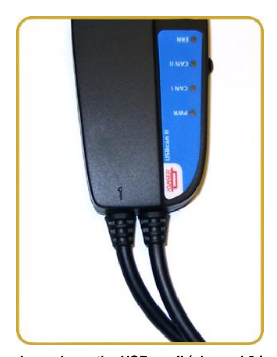
Figure 2. The channels on the USBcan II (channel 2 is not marked).