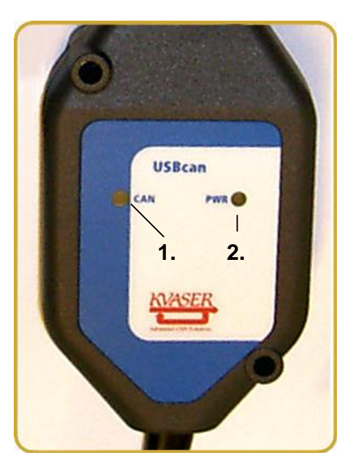
Figure 4. USBcan Rugged. LED configuration.