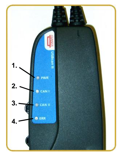
Figure 3. USBcan II LED configuration.

The LED's have somewhat different meaning on the different hardware. See Table 2 for USBcan II or Table 3 for USBcan Rugged.