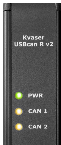
Figure 4: LEDs on the Kvaser USBcan R v2.

The Kvaser USBcan R v2 has three LEDs as shown in Figure 4. Their functions are shown in Table 2 on Page 9.