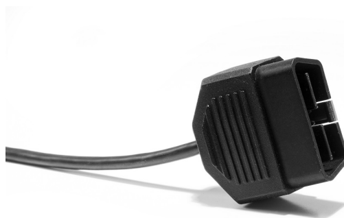
Figure 3: OBDII Type B CAN connector.

The CAN connector for the Kvaser U100-X3 is the 16-pin OBDII Type B plug which has the pinning described in Table 2 on Page 9.