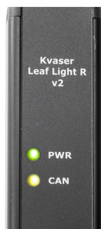
Figure 4: LEDs on the Kvaser Leaf Light R v2.

The Kvaser Leaf Light R v2 has two LEDs as shown in Figure 4. Their functions are shown in Table 2 on Page 9.