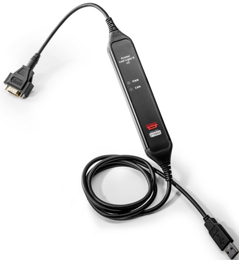
Figure 1: Kvaser Leaf Light R v2

Kvaser Leaf Light R v2 is a reliable low cost product. In hostile environments where dust and water are the norm, the IP65 rated housing assures reliable protection. With a time stamp precision of 100 microseconds it handles transmission and reception of standard and extended CAN messages on the bus. It is compatible with applications that use Kvaser's CANlib.