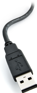
Figure 2: A standard USB type "A" connector.

The Kvaser Leaf Light R v2 has a standard USB type "A" connector.