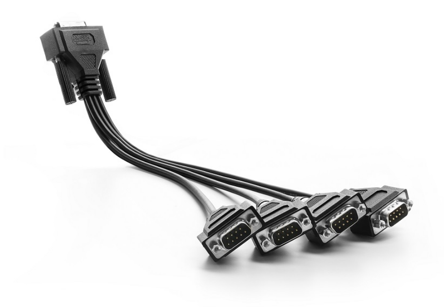
Figure 6: The HD26-4xDS9 Splitter