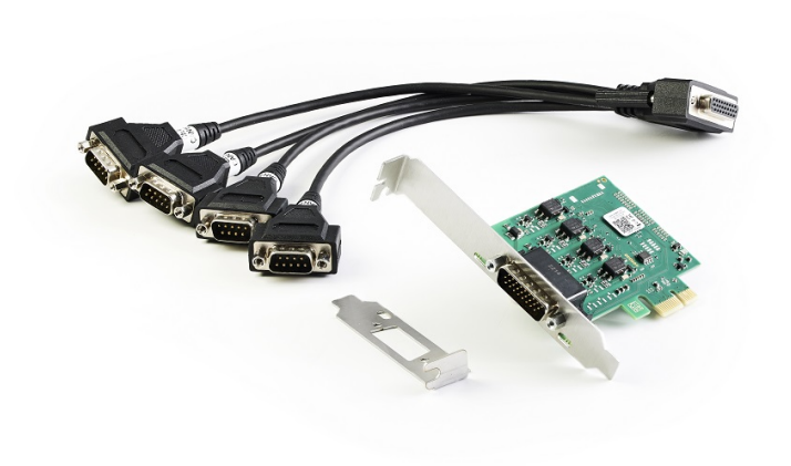
Figure 1: Kvaser PCIEcan 4xCAN v2

Kvaser PCIEcan 4xCAN v2 is a small, yet advanced, CAN multi channel real time CAN interface that handles transmission and reception of standard and extended CAN messages on the bus with a high time stamp precision. It is compatible with applications that use Kvaser's CANlib.