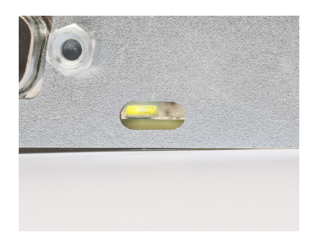
Figure 3: LED on the Kvaser PCIEcan 1xCAN v3.