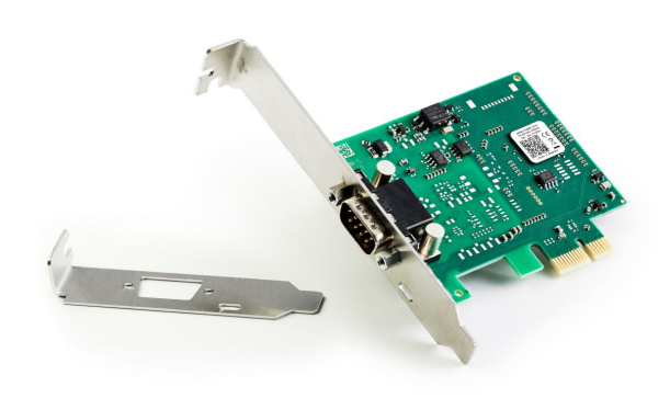
Figure 1: Kvaser PCIEcan 1xCAN v3

Kvaser PCIEcan 1xCAN v3 is a small, yet advanced, real time CAN interface that handles transmission and reception of standard and extended CAN messages on the bus with a high time stamp precision. The Kvaser PCIEcan 1xCAN v3 is compatible with applications that use Kvaser's CANlib.