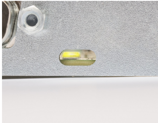
Figure 3: LED on the Kvaser PCIEcan HS v2.