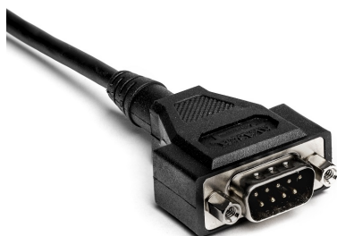
Figure 3: 9-pin D-SUB CAN connector

The Kvaser Leaf Light R v2 has one CAN Hi-Speed channel with a 9-pin D-SUB CAN connector. See Section 4.2, CAN connector, on Page 11 for details about the pinout.