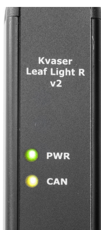
Figure 4: LEDs on the Kvaser Leaf Light R v2.

The Kvaser Leaf Light R v2 has two LEDs as shown in Figure 4. Their functions are shown in Table 2 on Page 9.