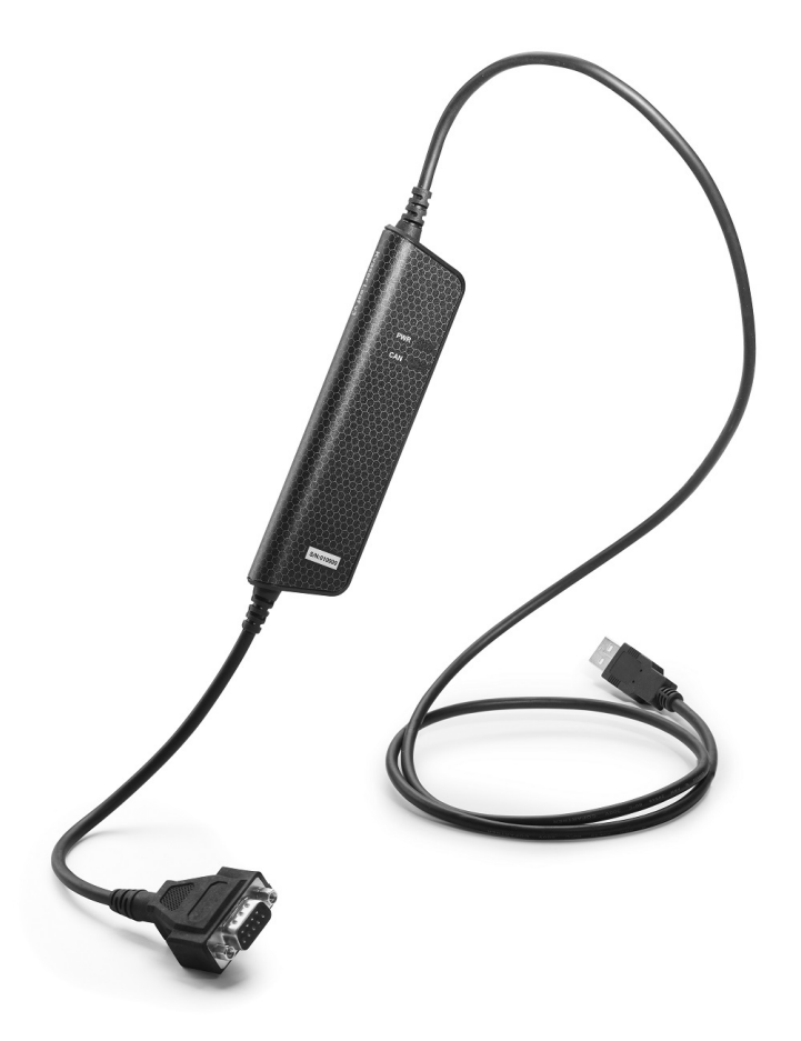
Figure 1: Kvaser Leaf v3

Kvaser Leaf v3 is a reliable low cost product. With a timestamp precision of 50 microseconds it handles transmission and reception of standard and extended CAN messages on the bus. It is compatible with applications that use Kvaser's CANlib.