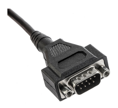
Figure 3: 9-pin D-SUB CAN connector.

The CAN connector for the Kvaser Leaf v3 is the 9-pin D-SUB connector (see Figure 3 on Page 9) which has the pinout described in Table 2 on Page 9.