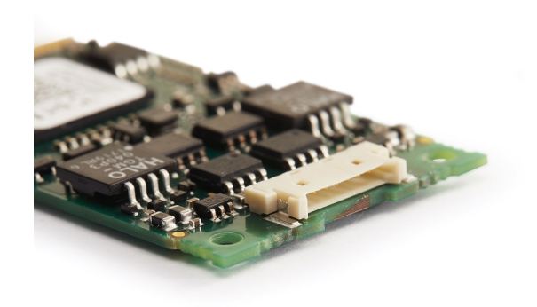
Figure 3: CAN connector on Kvaser Mini PCI Express 2xCAN v3