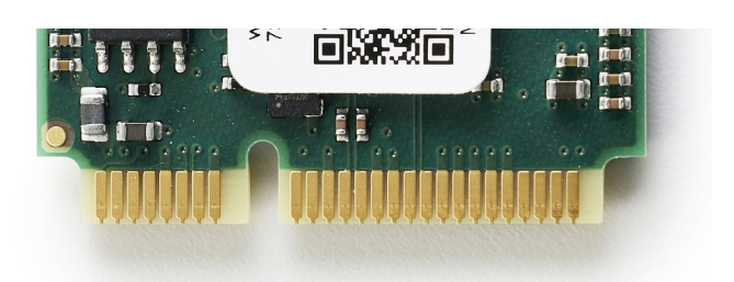
Figure 2: Mini PCI Express connector on Kvaser Mini PCI Express 2xCAN v3

The Kvaser Mini PCI Express 2xCAN v3 is a card of type F2 (Full-Mini with bottom side keep outs).