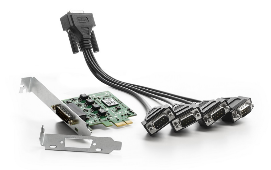
Figure 1: Kvaser PCIEcan 4xHS

Kvaser PCIEcan 4xHS is a small, yet advanced, CAN multi channel real time CAN interface that handles transmission and reception of standard and extended CAN messages on the bus with a high time stamp precision. It is compatible with applications that use Kvaser's CANlib.